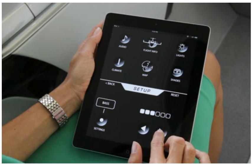
CABIN MANAGEMENT SYSTEM